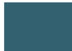
OLD TOWN GRAY

Due to variations in monitors and browsers, representation of colors may appear differently than actual colors. To confirm color, order a metal sample prior to placing metal order.